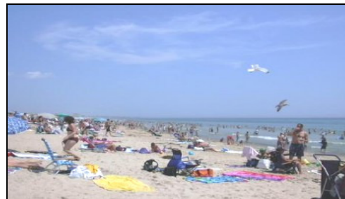
Misquamicut Beach - Rhode Island